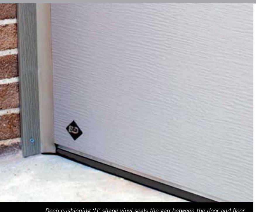
Deep cushioning 'U' shape vinyl seals the gap between the door and floor.