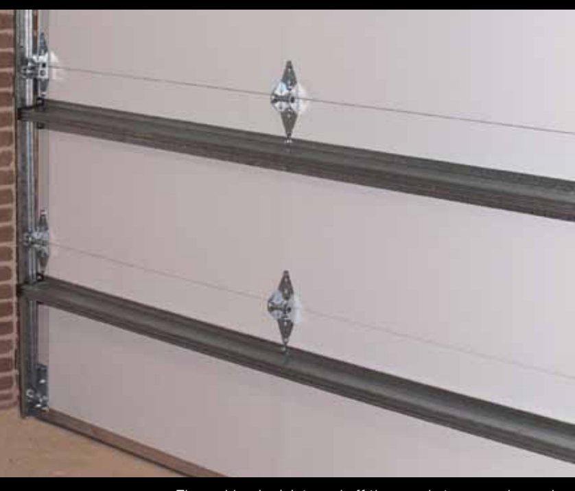
Thermal barrier joints seal off the gaps between each panel.