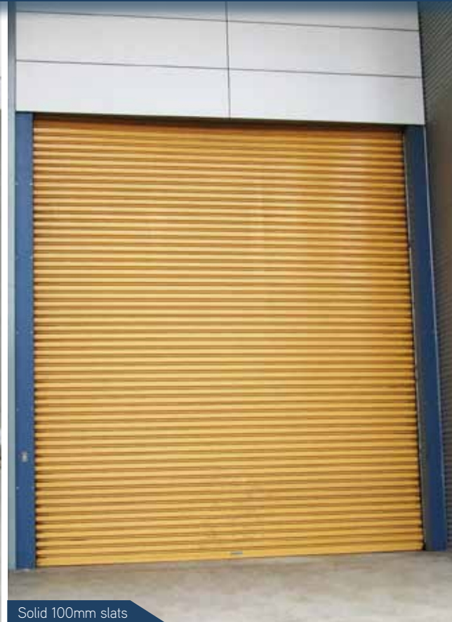
Solid 100mm slats

Mirage steel roller shutters are available with 75mm or 100mm wide slats, cater for the largest of openings and provide enhanced security. Additional strength is obtained by using windlock clips and guides.