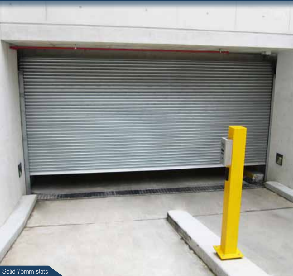
Solid 75mm slats