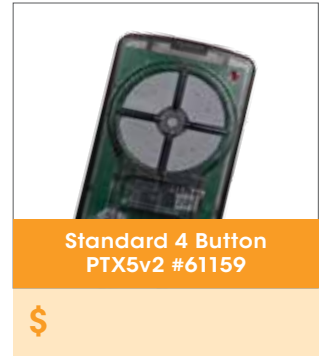
Standard 4 Button PTX5v2 #61159