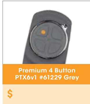
Premium 4 Button PTX6v1 #61229 Grey