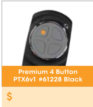
Premium 4 Button PTX6v1 #61228 Black