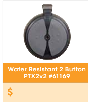
Water Resistant 2 Button PTX2v2 #61169