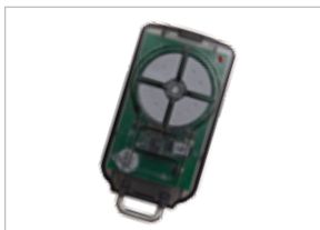
Standard 4 Button