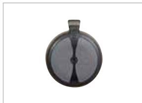
Water Resistant 2 Button