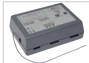
Standalone Receiver 1 Channel #14800