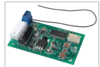
Plug in Receiver 2 Channel #14810