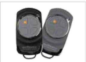
Premium 4 Button