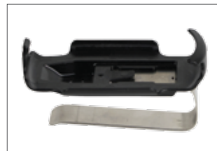
PTX6 Visor Clip Pack #61402